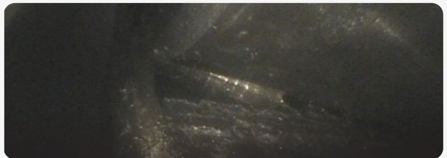
Figure 2 - Main bearing outer raceway damage

After discovering key information via fleetMONITOR data, CEB performed inspections and confirmed the findings that showed there were issues with the bearings.